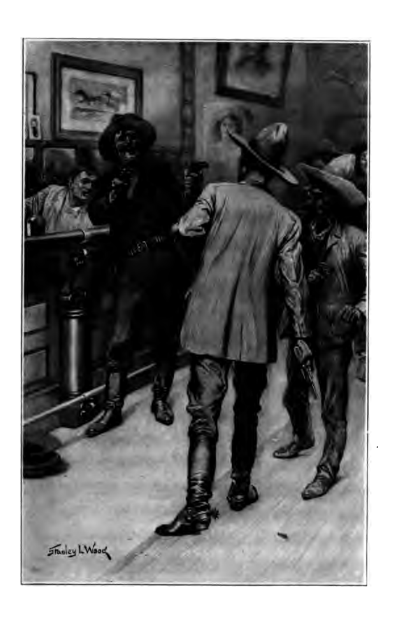
"Want my guns?" shouted Nick derisively. "Then come and take 'em!" [Page 26]